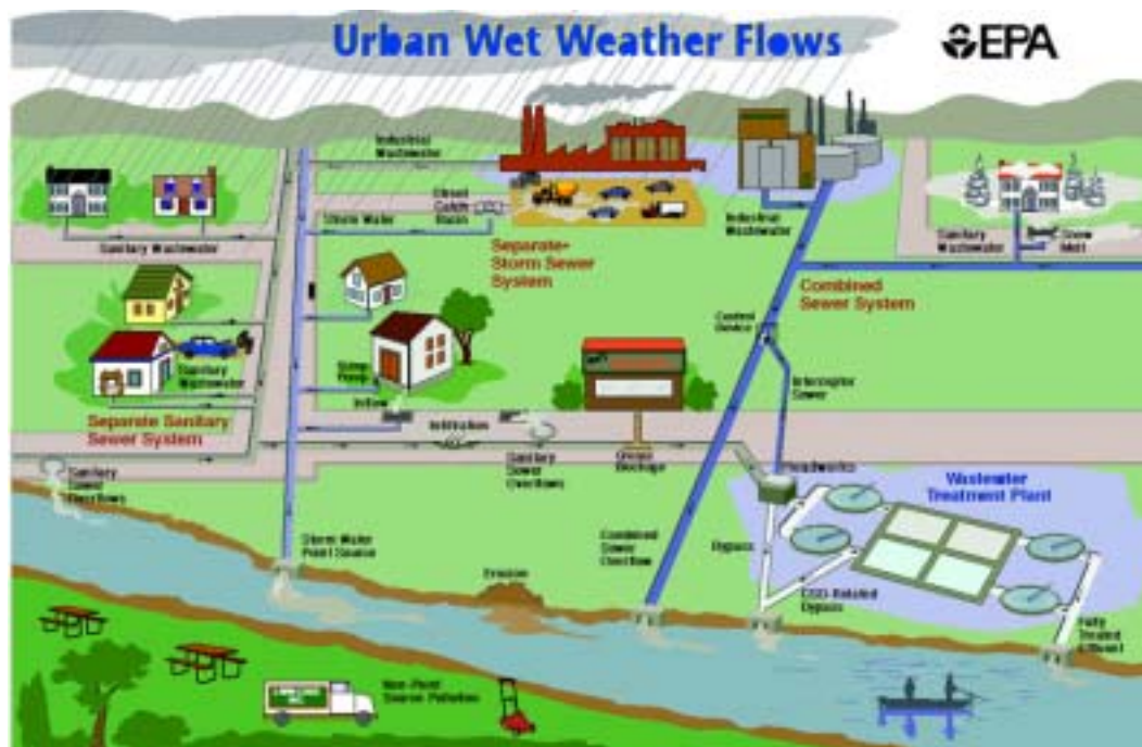
Fig. 1. Operation of Combined and Separated Sewer Systems 9