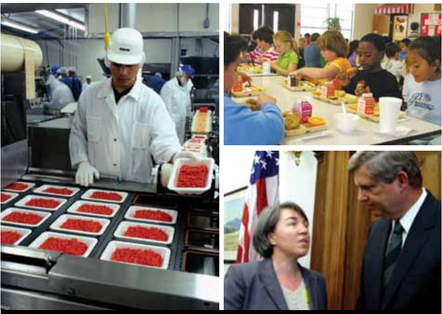
Of the 76 million cases of foodborne illnesses reported each year, half occur in kids. We're calling for higher standards for high-risk food, like meat and eggs, served in school lunches.

Starting in May, hundreds of campaign staff went door-to-door in 20 states (including California) to inform the public of the current food safety standards and what we plan to do to raise them.